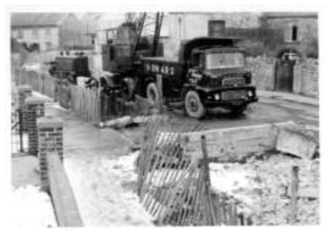
High Street 1965

Find us at <u>www.worlehistorysociety.net</u> or on Facebook.