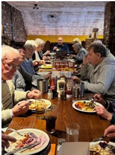
Munch and chat in good company