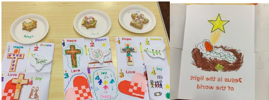
Craft Activities for Advent Messy Church at St Martin's School