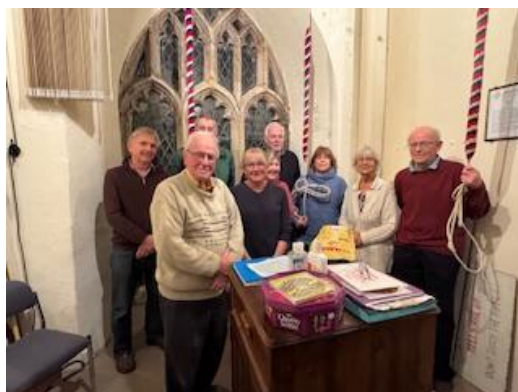
Some of St Martin's ringers and friends

We have also hosted the Axbridge Branch training morning and visiting ringers.